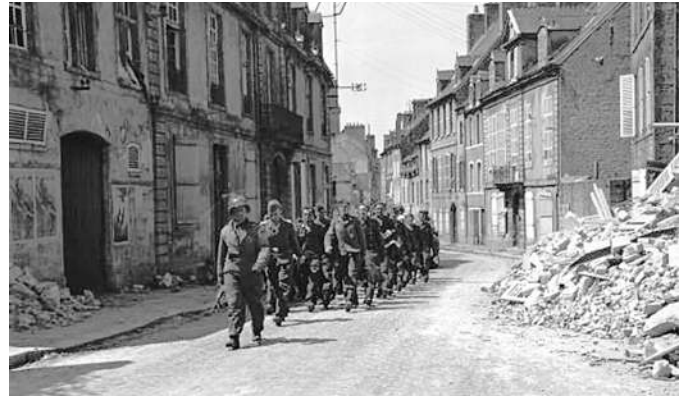
Above: German prisoners are marched along a less badly bombed section of the Rue des Religieuses on June 21st, 1944, the day after the town was liberated.

reconnaissance team from the 4th Infantry Division's 8th Infantry Regiment reached the outskirts of Valognes backed up by light armour. The main force arrived on the morning of June 20th to find the town practically deserted.