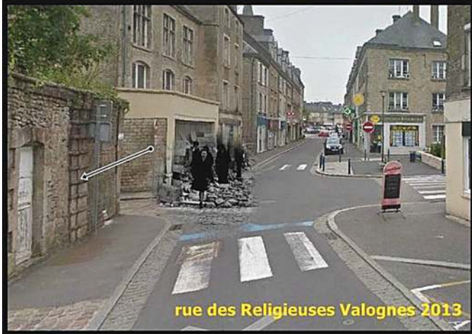
Above: A 'then and now' photo montage showing a devastated part of the Rue des Religieuses. The Place Vicq d'Azir is in the distance.