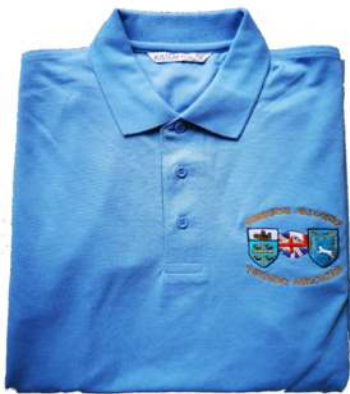
Short sleeve polo shirts