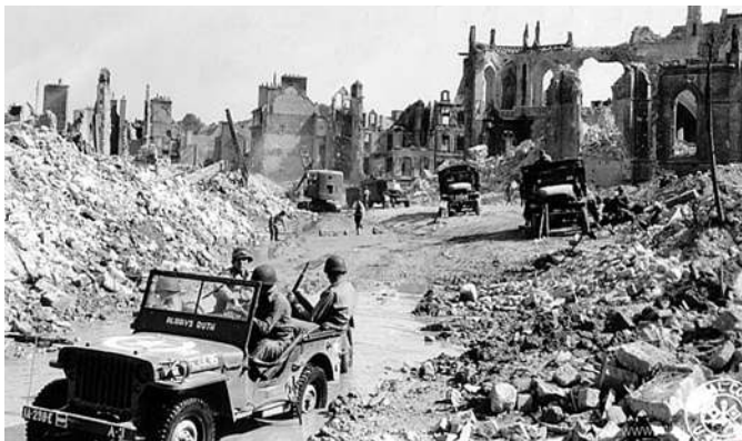
Above: The centre of Valognes was devastated by the US bombing. Part of the ruined Église Saint-Malo can be seen at right. The Jeep in the foreground belonged to the US Army's 298th Engineer Combat Battalion which cleared the rubble from the roads.

After raids on June 6th and 7th, the most destructive bombing took place on June 8th and then again on June 9th. The American bombers accurately aimed for the centre of the town, destroying virtually everything in and around the Place du Château and the Place Vicq d'Azir, thus completely wrecking the historic Église Saint-Malo and the surrounding streets. Many other buildings in and around Valognes were also hit.