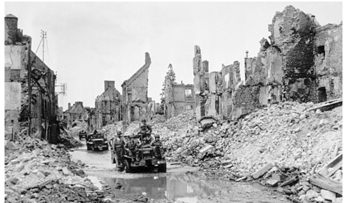
Valognes on their way to the Cherbourg battle following the clearance of rubble from the roads. The bombed half-house on the right was still standing at that time.

In the years following World War Two, a massive reconstruction took place across Normandy to rebuild shattered towns and villages. For Valognes, Marshall Aid from the US was forthcoming, although the historic appearance of the town pre-1944 was not reproduced. Few of the devastated chateaux and fine residences of the town and its vicinity were rebuilt, an exception being the Hôtel de Louvières in the Boulevard Félix Buhot.