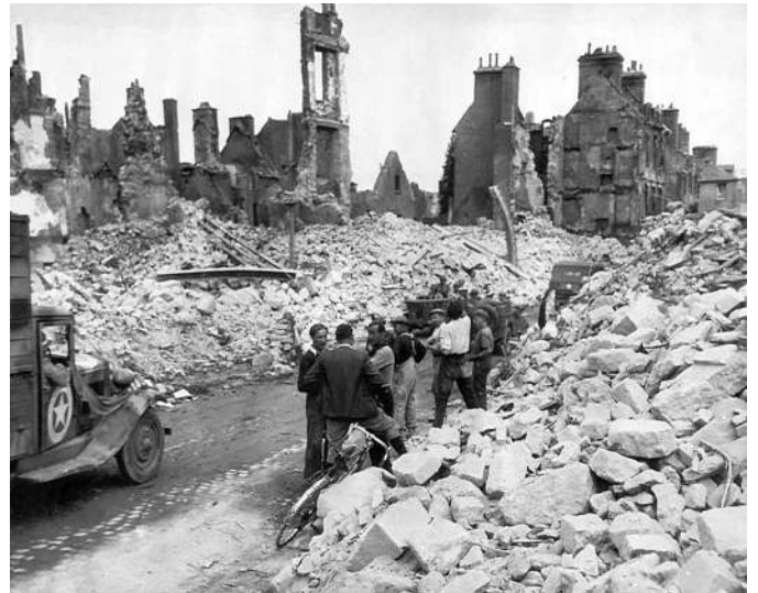
Above: With the rubble cleared from the roadways, the US Army vehicles could pick their way through Valognes on their way north to the battle for Cherbourg.