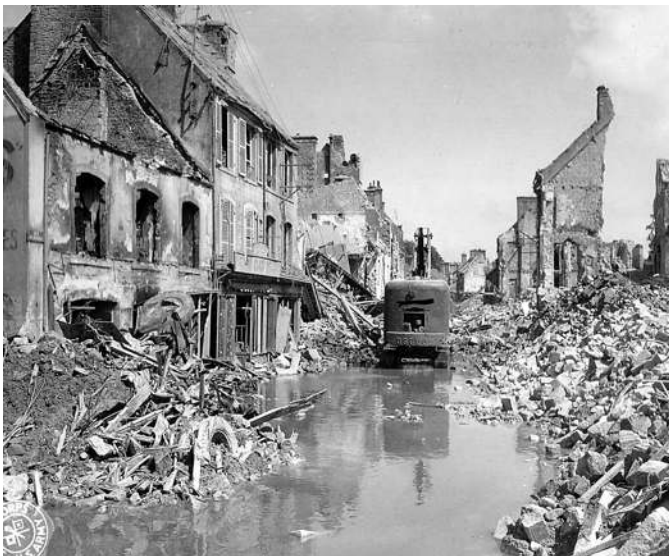
Above: The bombing of Valognes not only devastated buildings, it destroyed infrastructure. Here a water main had burst, while a US Army engineer manoeuvred his Osgood earth-mover. Note the bombed half-house on the right.